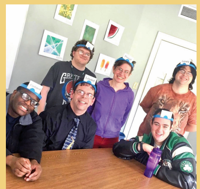
In Emotional Wellbeing class, LIVE members wore cards with different emotions and tried to guess what it was as the group provided clues